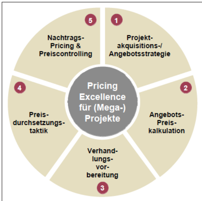
Abbildung 1: Pricing Excellence-Ansatz für (Mega-)Projekte

This graphic is clear, structured and reduced to one colour scheme. You could provide an illustration in a similar form to your article.